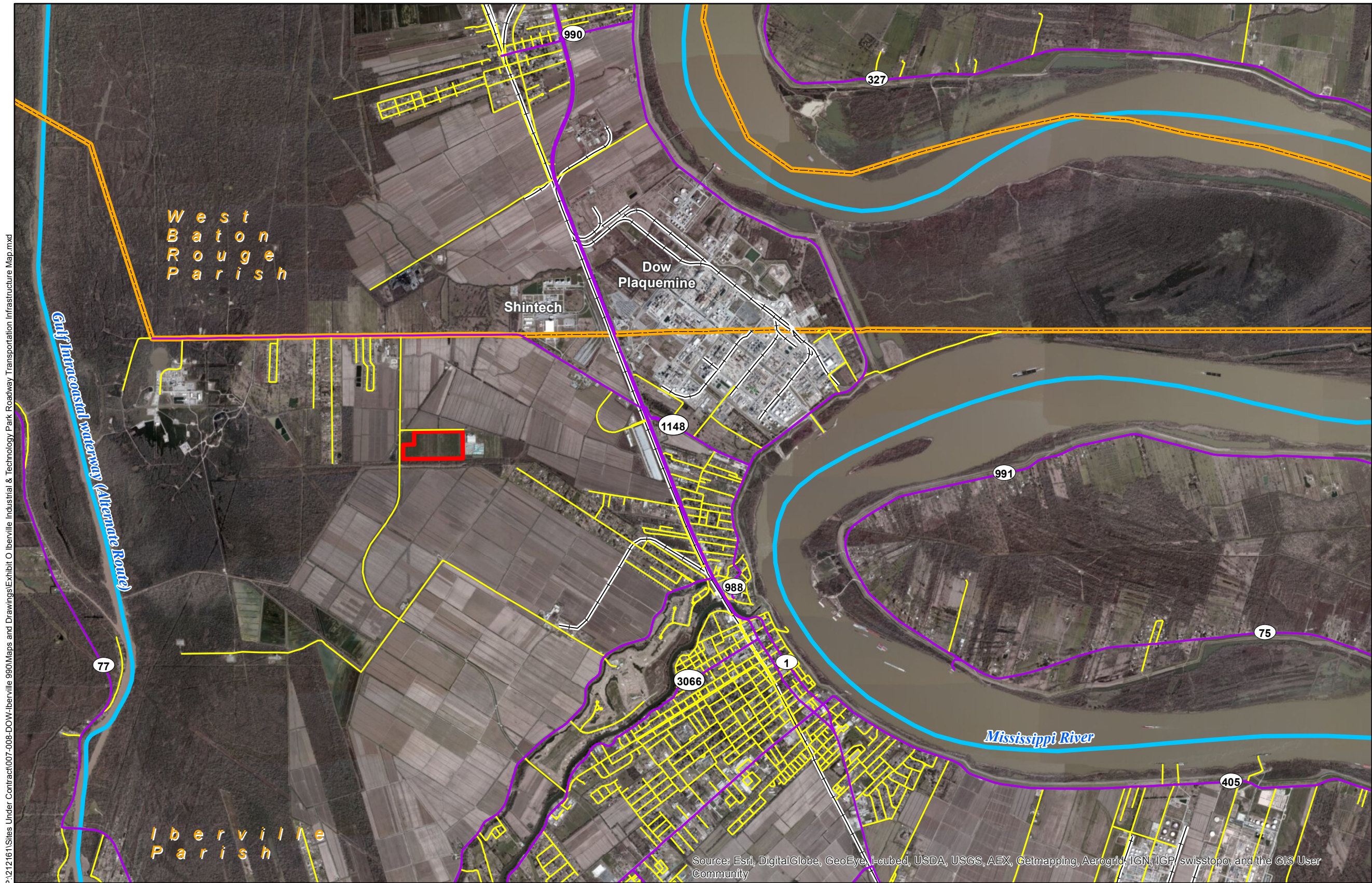
Exhibit N. Iberville Industrial & Technology Park Roadway Transportation Infrastructure Map

P:\212161\Sites Under Contract\007-008-DOW-Iberville Industrial & Technology Park Roadway Transportation Infrastructure Map.mxd