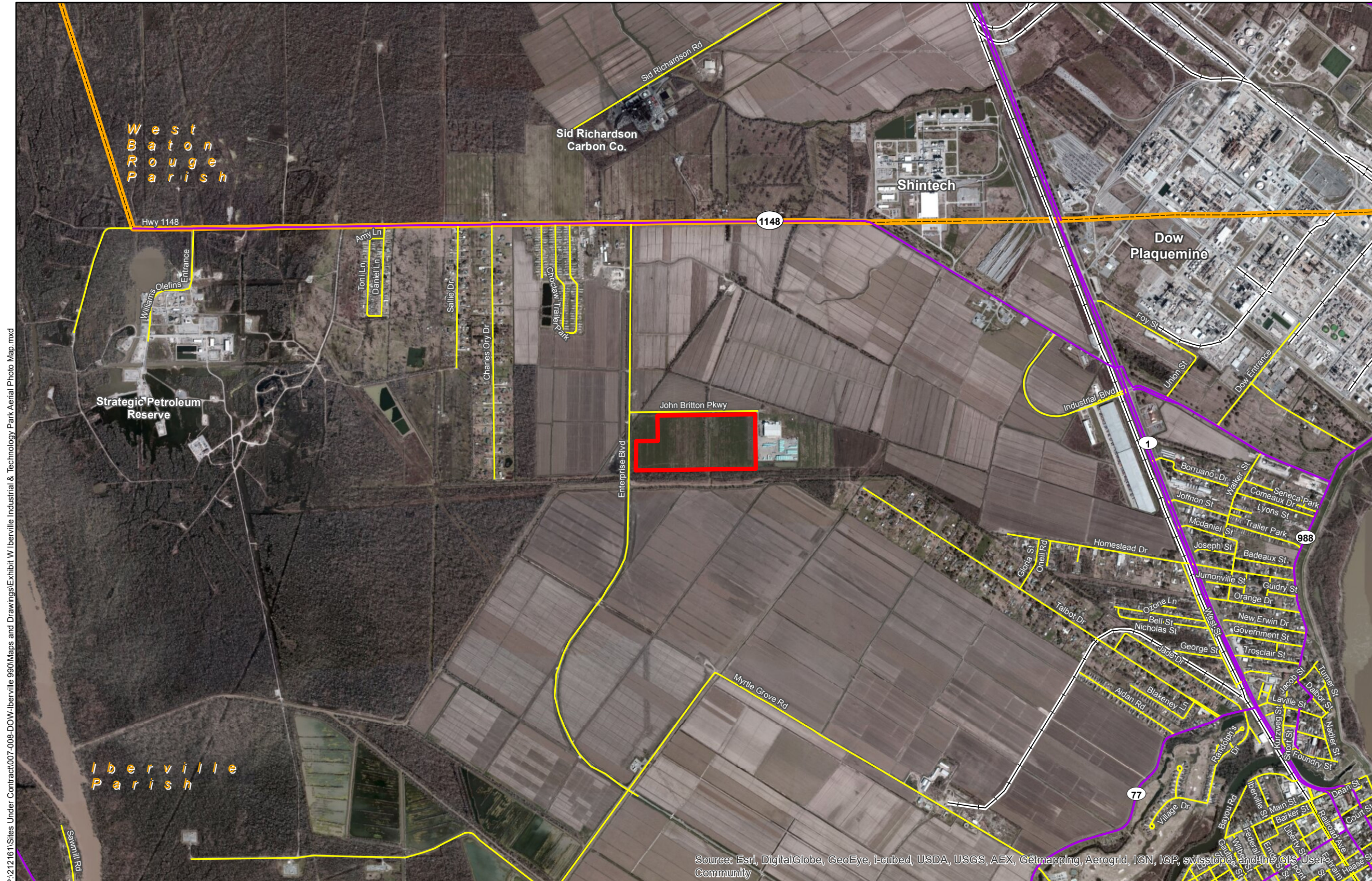
Exhibit W. Iberville Industrial & Technology Park Color Aerial Photo Map

P:\212161\Sites Under Contract\007-008-DOW-Iberville 990\Maps and Drawings\Exhibit W Iberville Industrial & Technology Park Aerial Photo Map.mxd